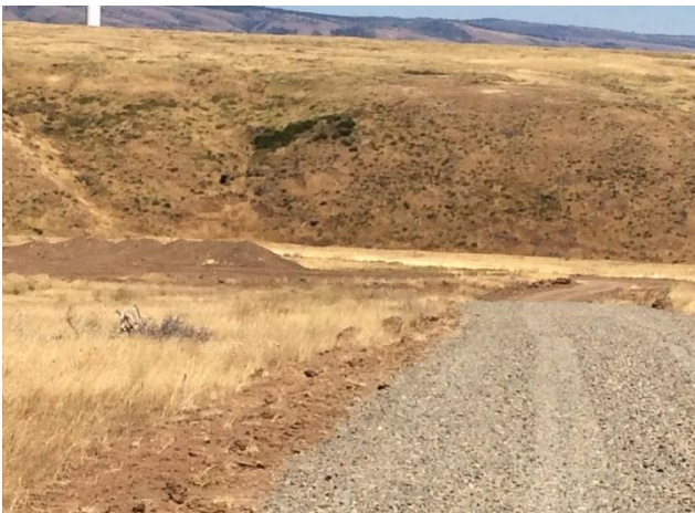
Freshly graveled road down into the future law enforcement range.