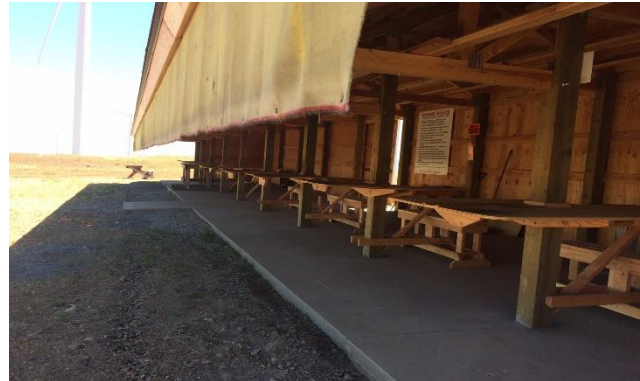
New benches inside the rifle shed. Also, note the dryer felt hanging on front to help control bullet trajectory from the tables. This restricts the view of the horizon, keeping shots down on our range instead of over the hill.