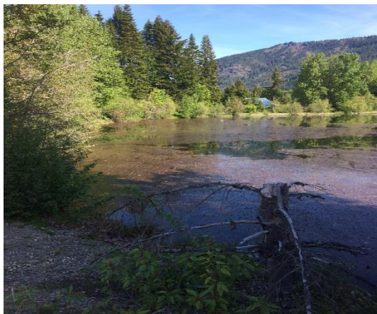
Milfoil at Lavender Lk