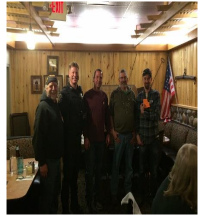
2019 annual raffle