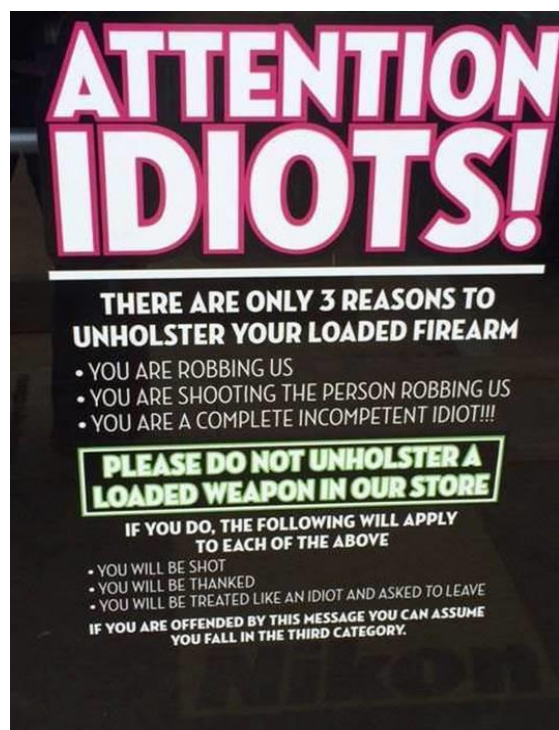
Steve Rogers, Editor

- Still having brass left on the rifle shed floor and the gate left unlocked!!! Someone shot some plastic jugs and then left them in the trash can. Please pick up after yourselves and take your trash home. Also, please re-read the range rules - "paper targets, steel, or clay pigeons only".