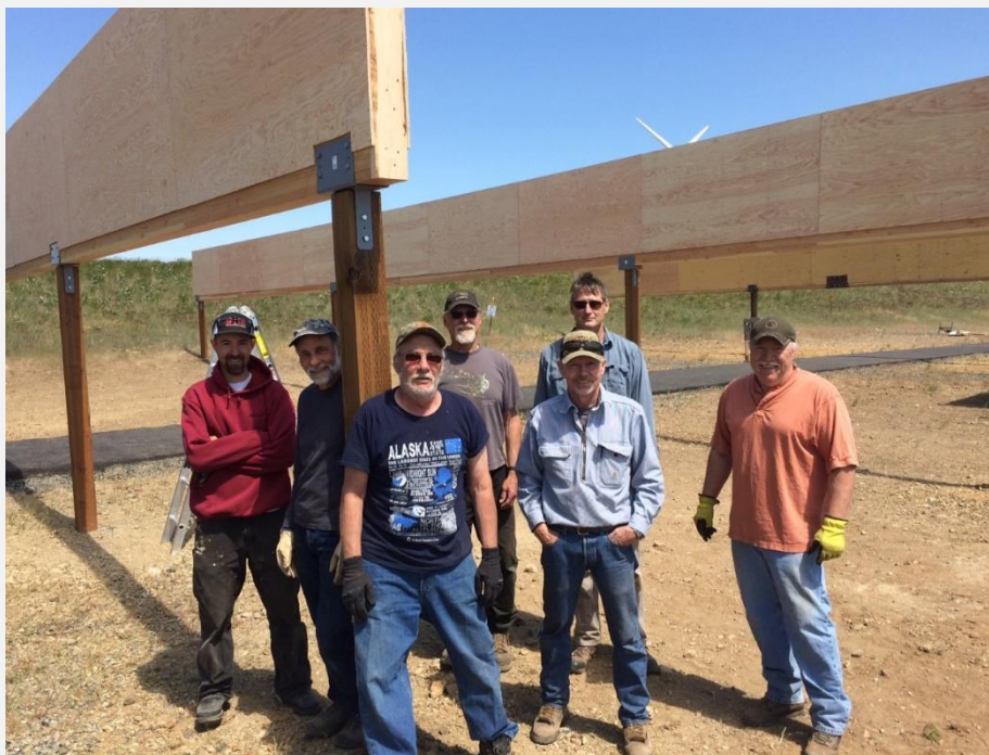
The Baffles are done - No Blue Sky from the shooting benches

We had 25 members present at the meeting Mon. night and Chris Felstad won the 50/50 drawing.