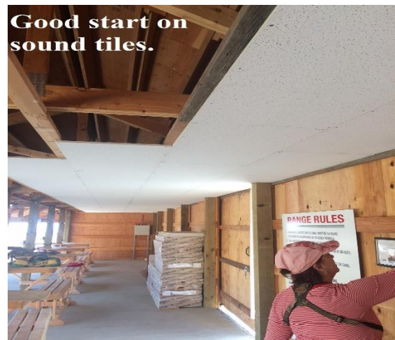
Good start on sound tiles.