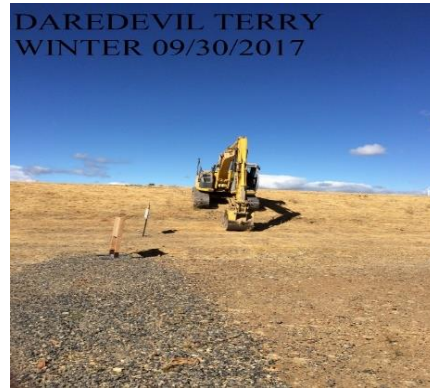
DAREDEVIL TERRY WINTER 09/30/2017