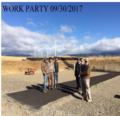
WORK PARTY 09/30/2017